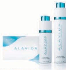
ALAVIDA Regenerating Trio

Improves the health of your skin from the inside out. 98.6% naturally derived, plant-sourced ingredients. Alavida elevates Epithalamin peptide. This peptide is responsible for vibrant skin, reduces the appearance of fine lines and wrinkles, builds collagen, tightens skin, and evens out skin tone and discoloration. The peptide in Alavida lengthens telomeres which is an indication of longevity.